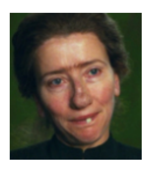
Lesson 3: Always get dressed when you are told