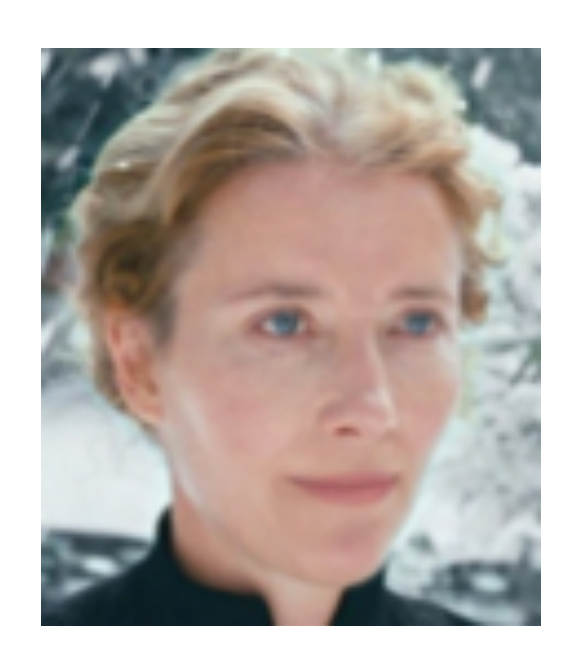
Lesson 5: Always do as you are told